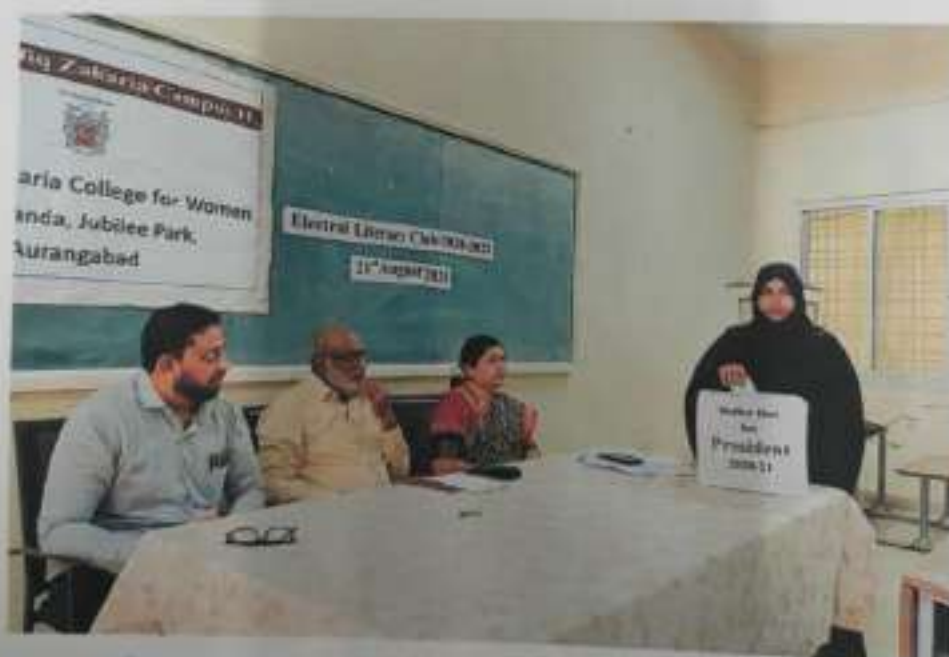
21/AUG/21 Election of president & vice president