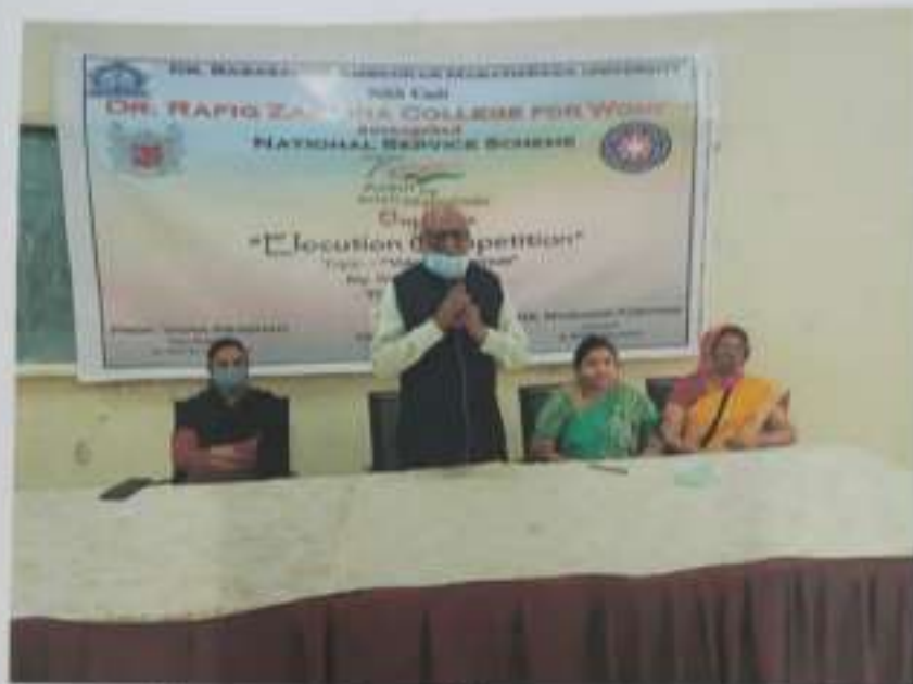
2 | Section & Elocution Competition