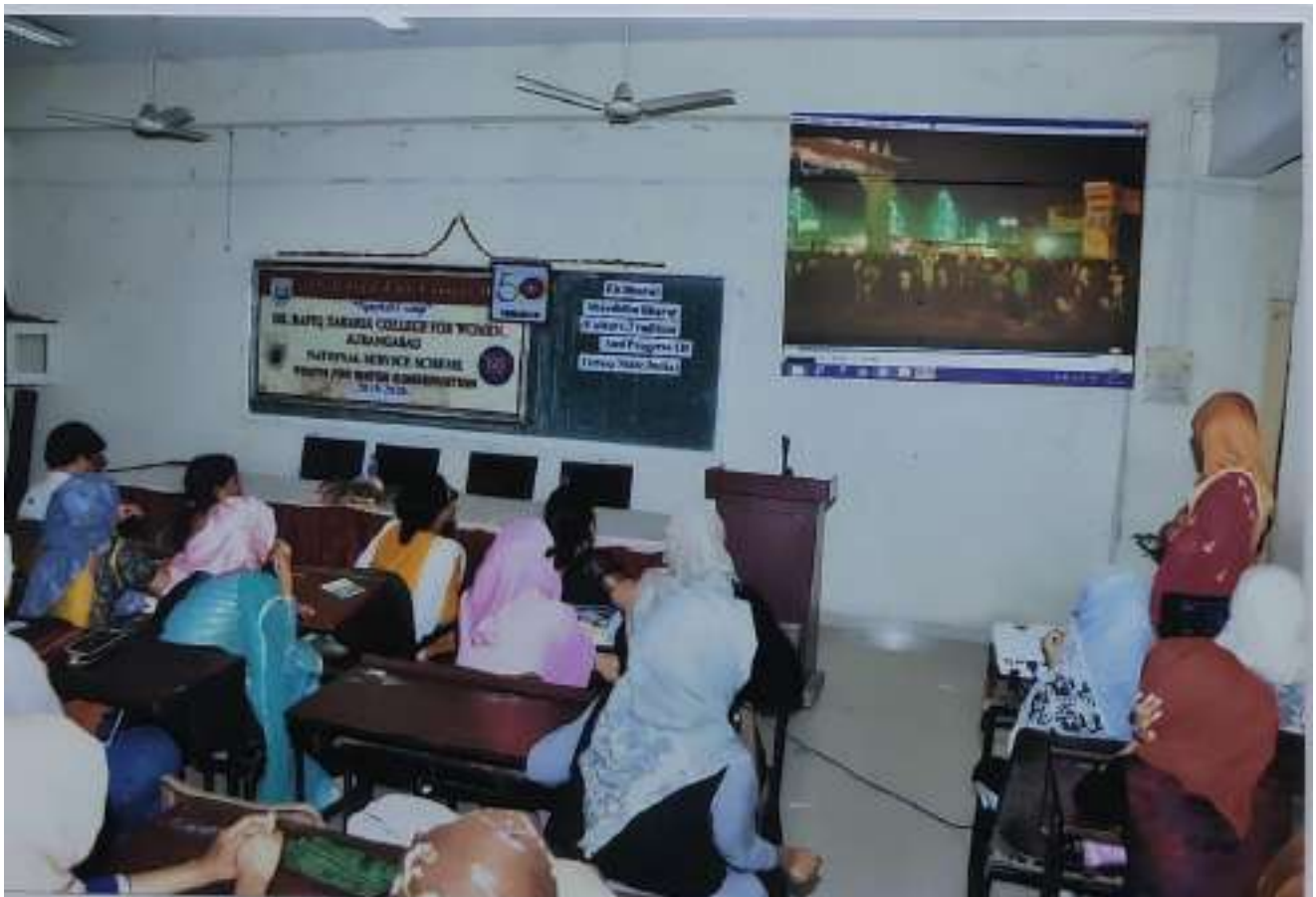
Workshop on “Combating with Dengue and Chicken Guniya”